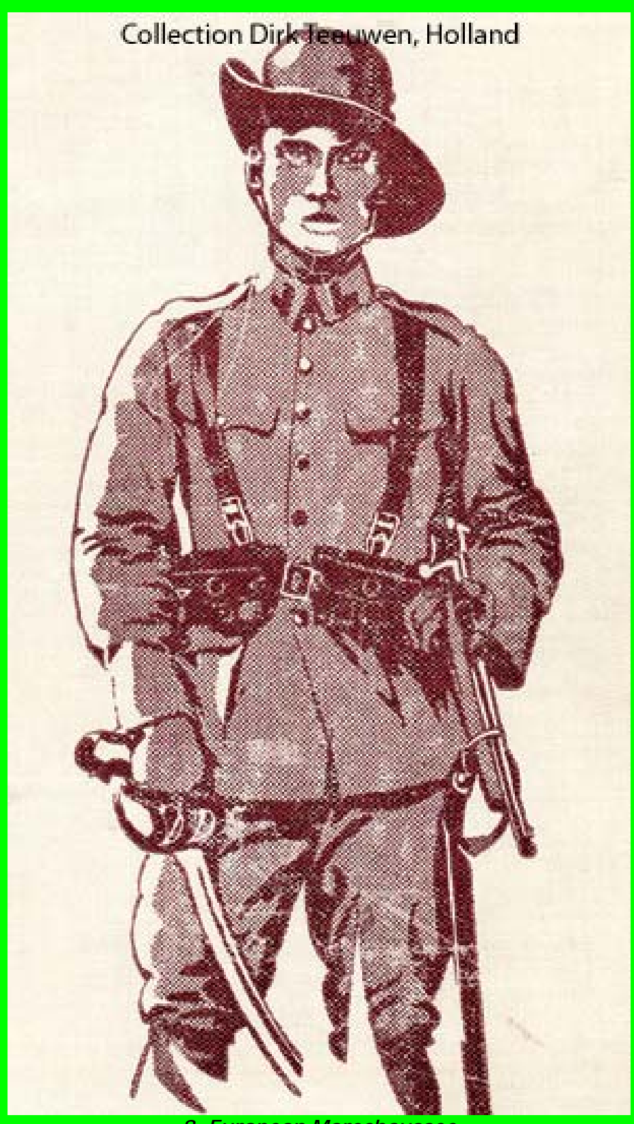
8. European Marechaussee Brasser, J. C.: Soldatenleven in de Indische wildernis; Zutphen Holland 1930, front page. Drawing by Pol Dam.