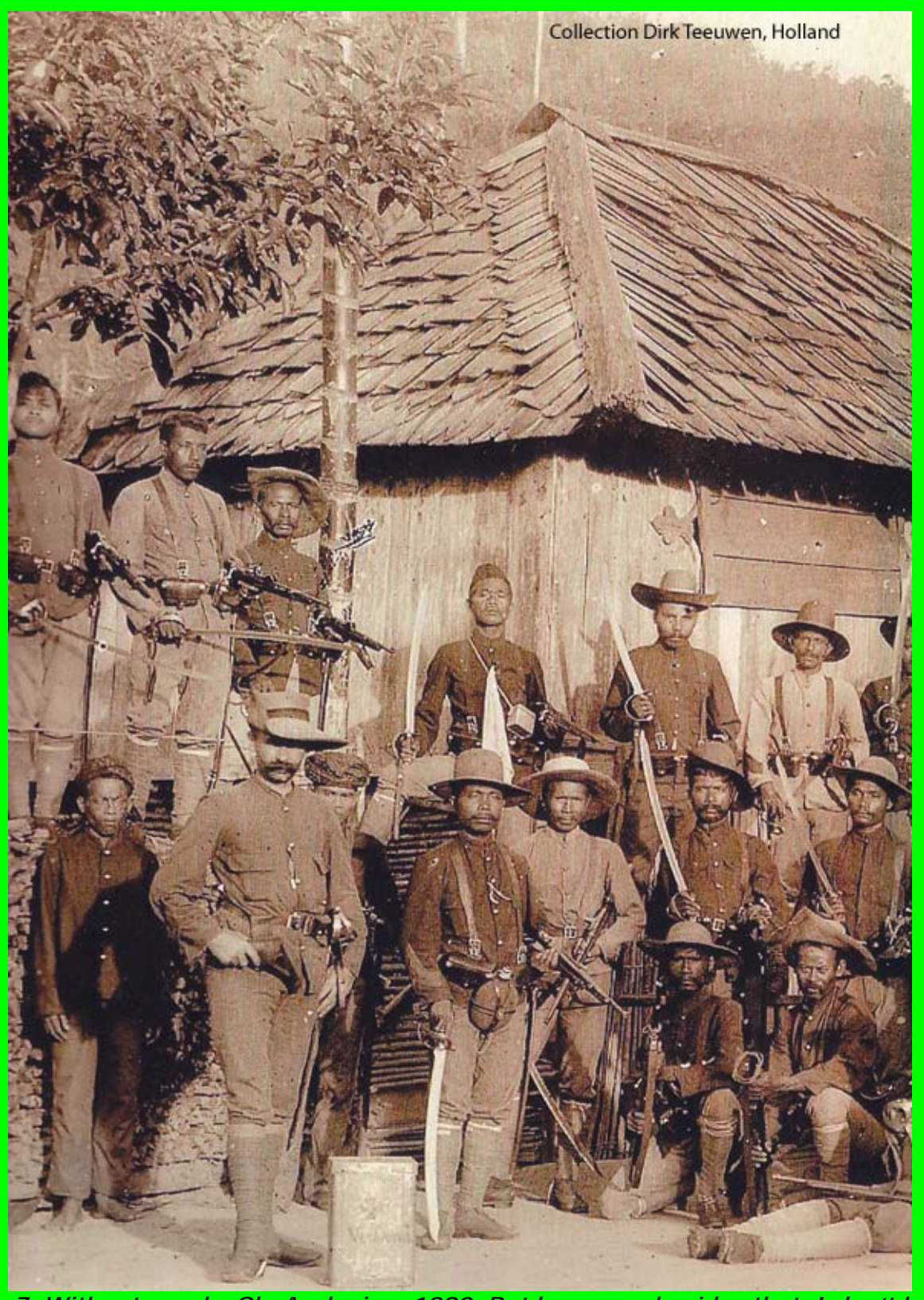
7. Without words. Ok, Aceh circa 1890. But however, besides that, I don't know where this (wonderful) picture comes from. Not the faintest idea.