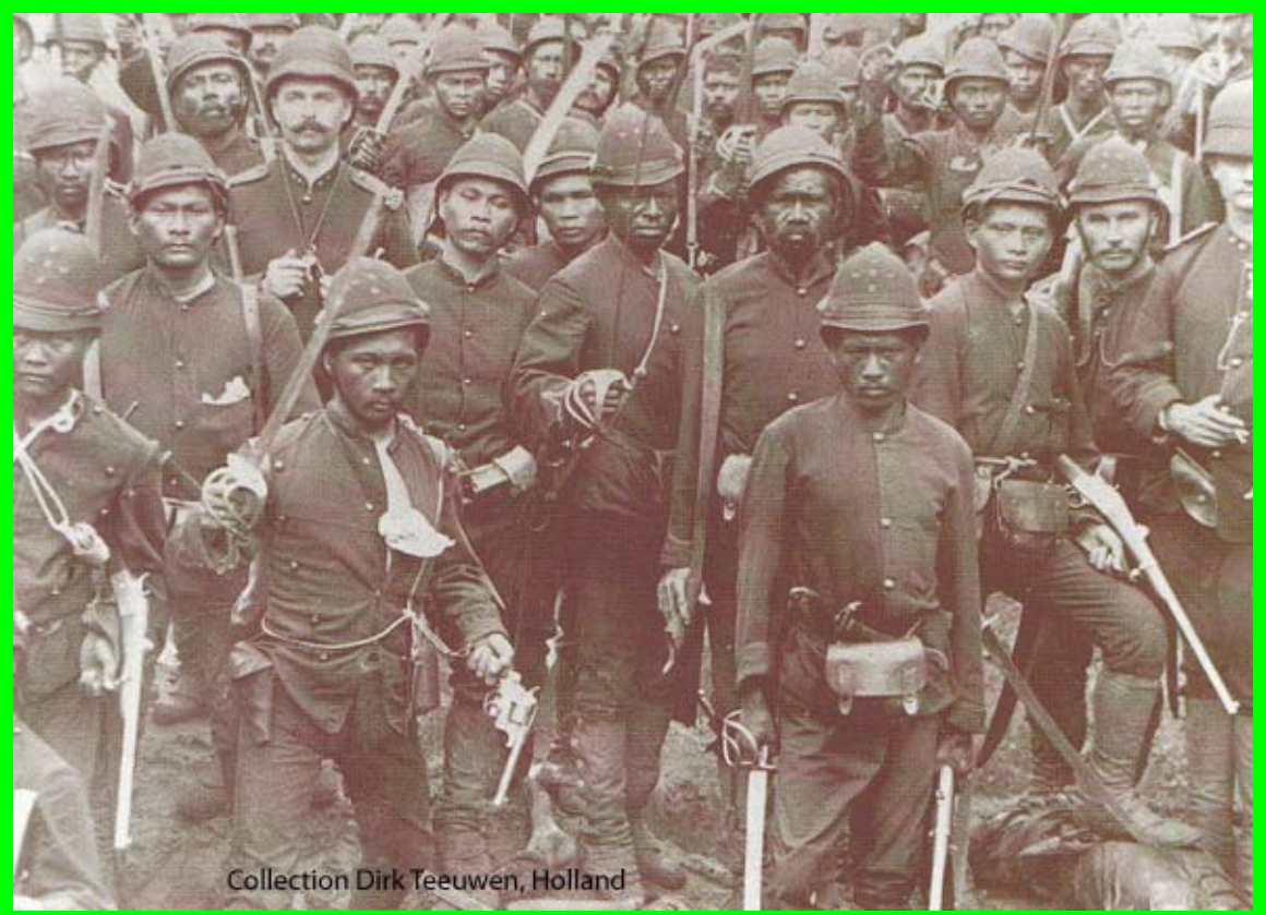
6. Shortly after the battle (Marechaussee Brigade near Sigli, Aceh 1902). Detail from a photo in > Pusat Dokumentasi Aceh: Perang colonial Belanda di Aceh; Banda Aceh 1977, p. 176